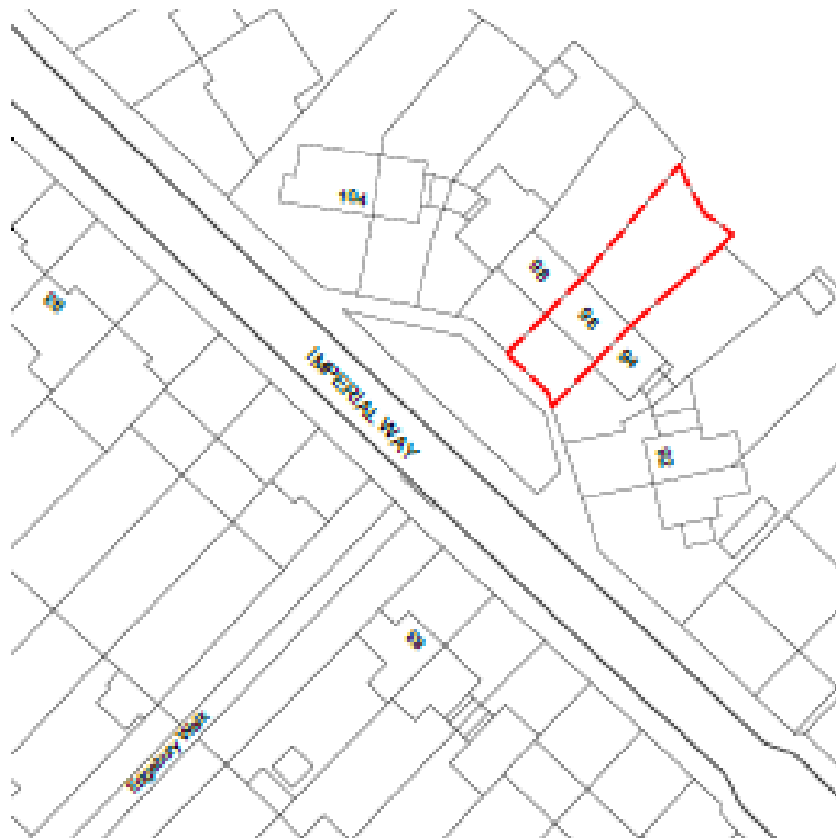
Figure 1: Site Plan